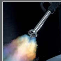
finesteam ® Technology