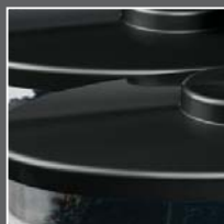
Dual Bean Hoppers