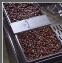
Dual Bean Hoppers