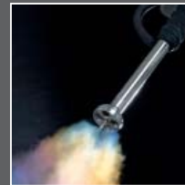
Auto Shut-Off Steam Wand