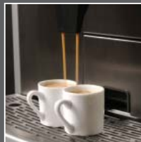
Consistent Shot Delivery